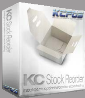
KC Stock Reorder