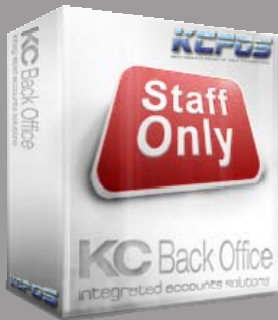
KC Back Office

Check out the KC-Software products and their fit with your business.